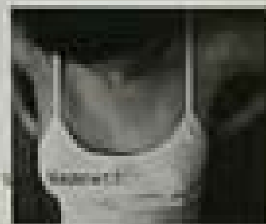
Full Green Full Dress by Kathleen Turner