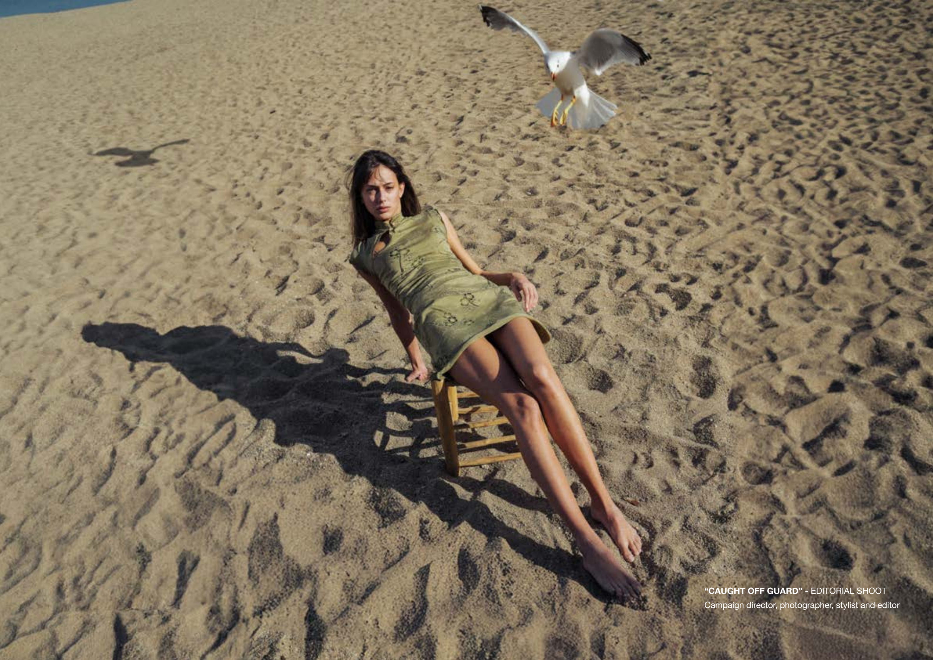
“CAUGHT OFF GUARD” - EDITORIAL SHOOT Campaign director, photographer, stylist and editor