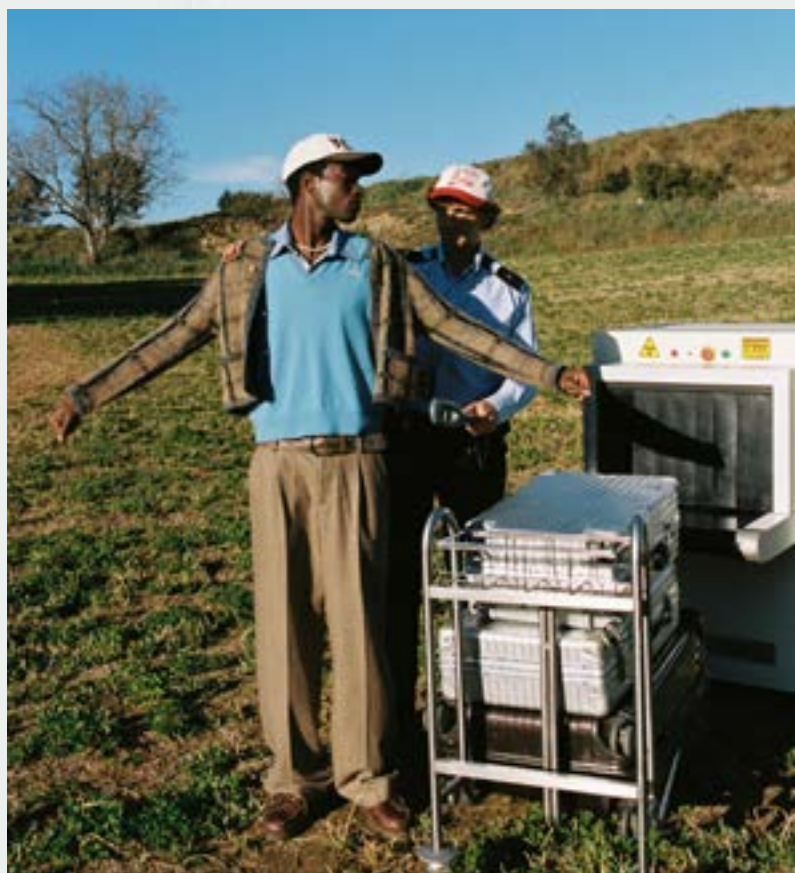
BEANYWOOD CAFÉ by Clavero - Campaign stylist