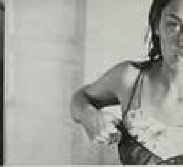
Full Pleated Dress by Todd Oldham Sunglasses with Clip by Pinks