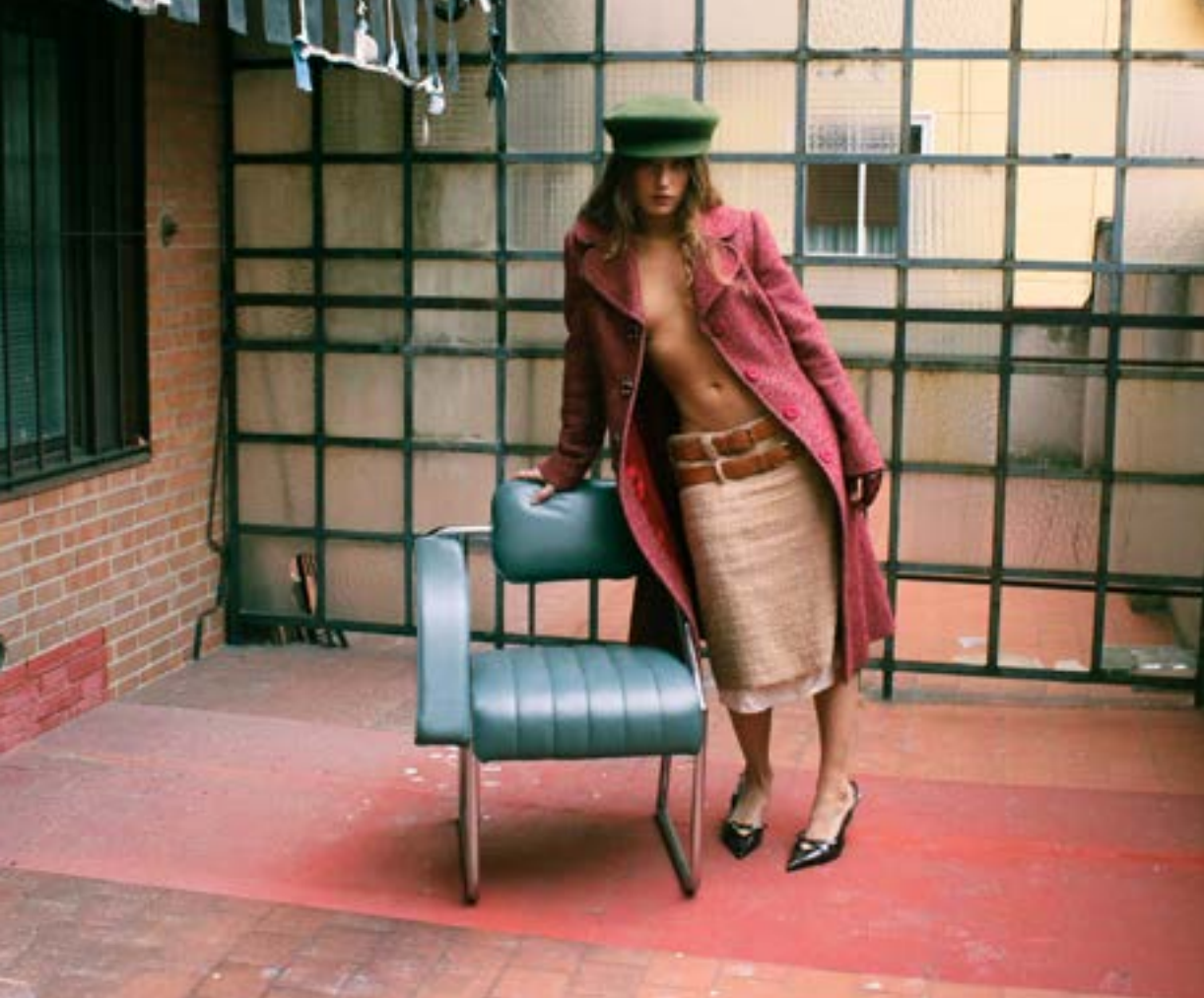
EDITORIAL SHOOT - Campaign director, stylist, photographer and editor