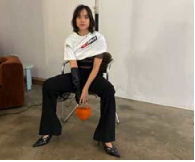
TRENT SHOWROOM - Ecommerce fittings, styled by Jazminna Frith